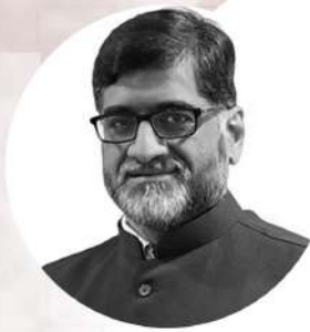
Shri. Sameer Unhale State Joint Commissioner Municipal Administration, Maharashtra